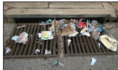
Litter ends up in our waterways when rain washes trash down the storm drain