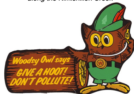
Let's Bring Back the Woodsy Owl Motto Give a Hoot, Don't Pollute!!