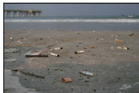
Cigarette butts end up on our beaches